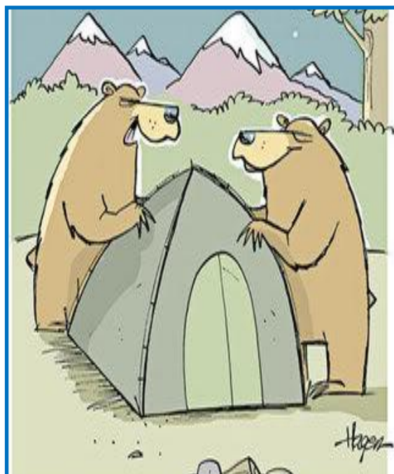
I just love how they com individually wrapped to seal in the flavour